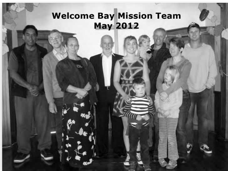
Welcome Bay Mission Team May 2012

Opportunity and involvement. These two words seem to come up a lot recently, and I believe they are great together - God presents us with opportunities, and we make a choice to get involved in what He is doing.