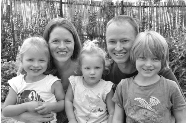
The Pirie Family